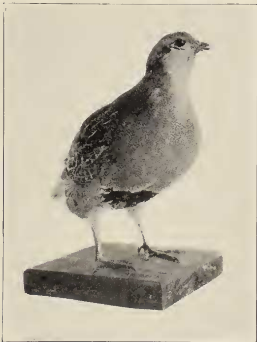
Mounted Hungarian Partridge Front View

Referring to a phase intimated at the beginning of this essay, that of the effect on native bird life of the introduction of these birds, I have found a diversity of opinion regarding the ultimate value of the species as game birds, also conflicting opinions regarding their ability